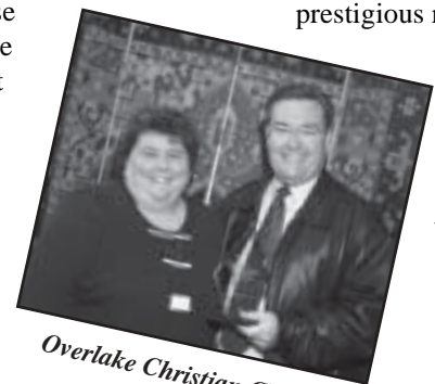
Overlake Christian Church